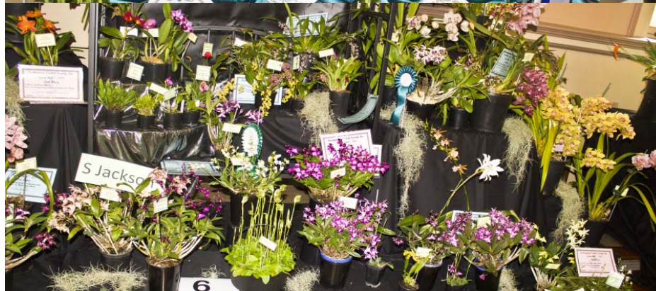
Pterostylis curta Grand Champion Spring Show Champion Display Spring Show